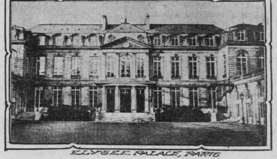
ELYSEE PALACE, PARIS