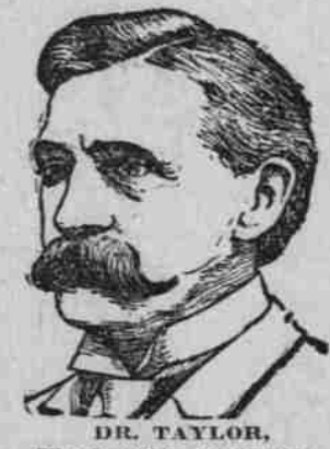
The Leading Specialist.

There is not a psysician living who can claim to be proficient in the treatment of all human atlments. To attain the highest possible degree of proficiency in all departments of medical science would require half a dozen lifetimes of study and as many more of practical experience. The regular practitioner is proficient in a large number of the commonest and most easily conquered allments. The specialist must first become proficient for general practice and must then go on to proficiency in a few of those conditions and allments more dificult to understand and more difficult to cure.