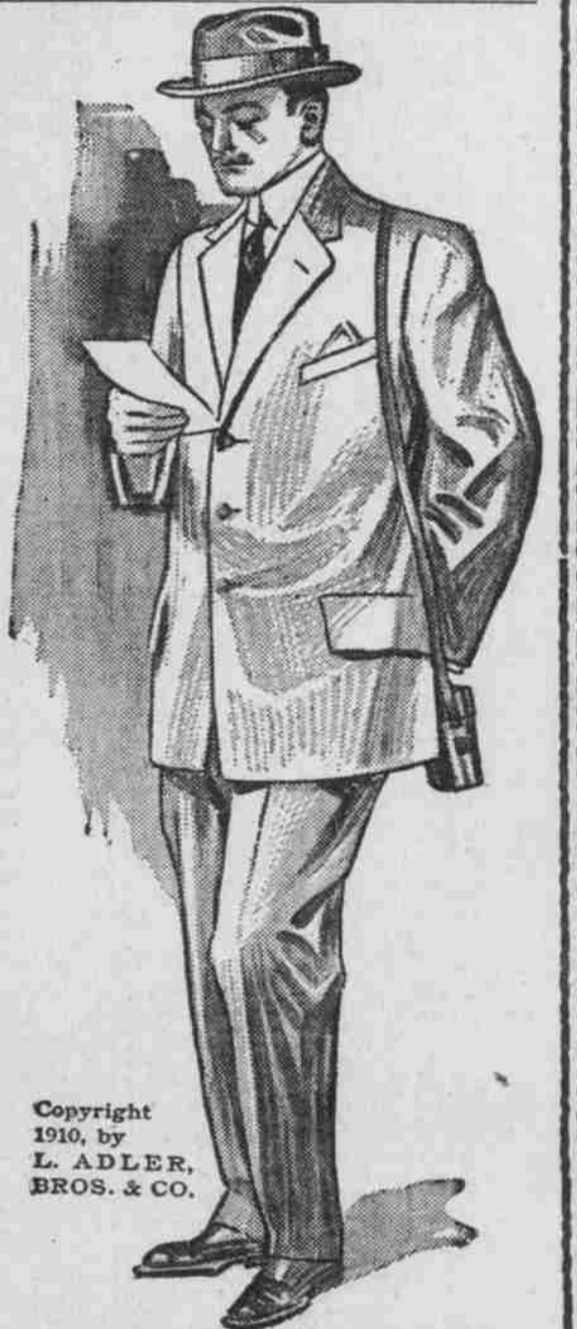
Copyright 1910, by L. ADLER, BROS. & CO.

Today, tomorrow and Saturday in the Third Floor Men's Clothing Section, all of our fine suits for men and young men, regularly sold at $18.00 and up, $5.00 less than regular price—Come and choose any that you wish; we offer them all at this saving, including the very handsome and exclusive Adler suits for which we have the sole Portland distribution—This is the annual Easter offer, as told of in the Wednesday evening papers—Suits for men of conservative taste or styles for the young men who want models with snap and "go" in them—Blacks, blues and fancies, all materials and all prices over $18.00—Join the style promenade with a new suit—the best-looking one on the street—On any men's or young men's suit in our stock, $18.00 or $5 over, today, tomorrow, Saturday you save $5 See Sixth-St. Window Display—Mail Orders Filled