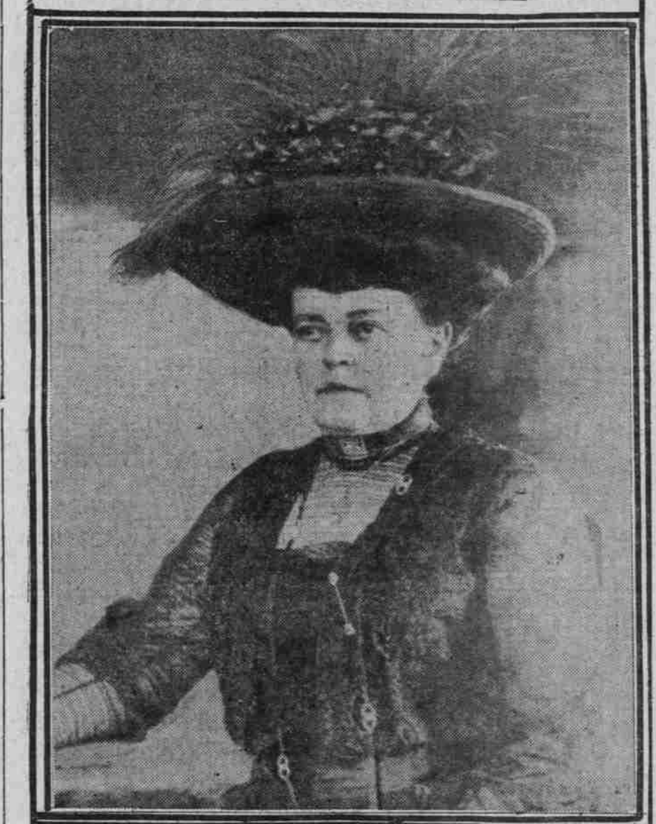
MRS. CLARENCE MACKAY (ABOVE) AND MRS. O. H. P. BELMONT.