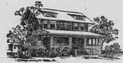
A No. 2-22 IDEAL Boiler and 400 ft. of 3/4-in. AMERICAN Radiators, costing the owner $200, were used to Hot-Water heat this cottage. At these prices the goods can be bought of any reputable, competent fitter. This did not include cost of labor, pipe, valves, freight, etc., which installation is extra and varies according to climatic and other conditions.

Regardless of location—whether farm or city—an IDEAL-AMERICAN outfit can easily be put in. It requires no city water supply. There is nothing to rust out, wear out, or give out—hence a paying investment that will net far more than money in the savings bank.