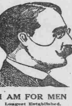
I AM FOR MEN

FREE MUSEUM. A $10,000 EDUCATIONAL EXHIBIT OF THE HUMAN BODY IN WAX REPRODUCTIONS. THE LARGEST AND FINEST ON THE COAST. FREE TO MEN.