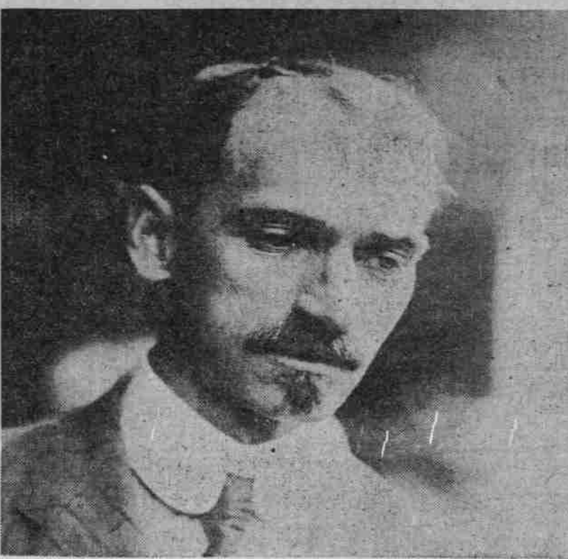
GLENN H. CURTISS.