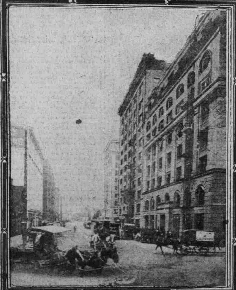
FOURTH STREET, NORTH FROM STARK