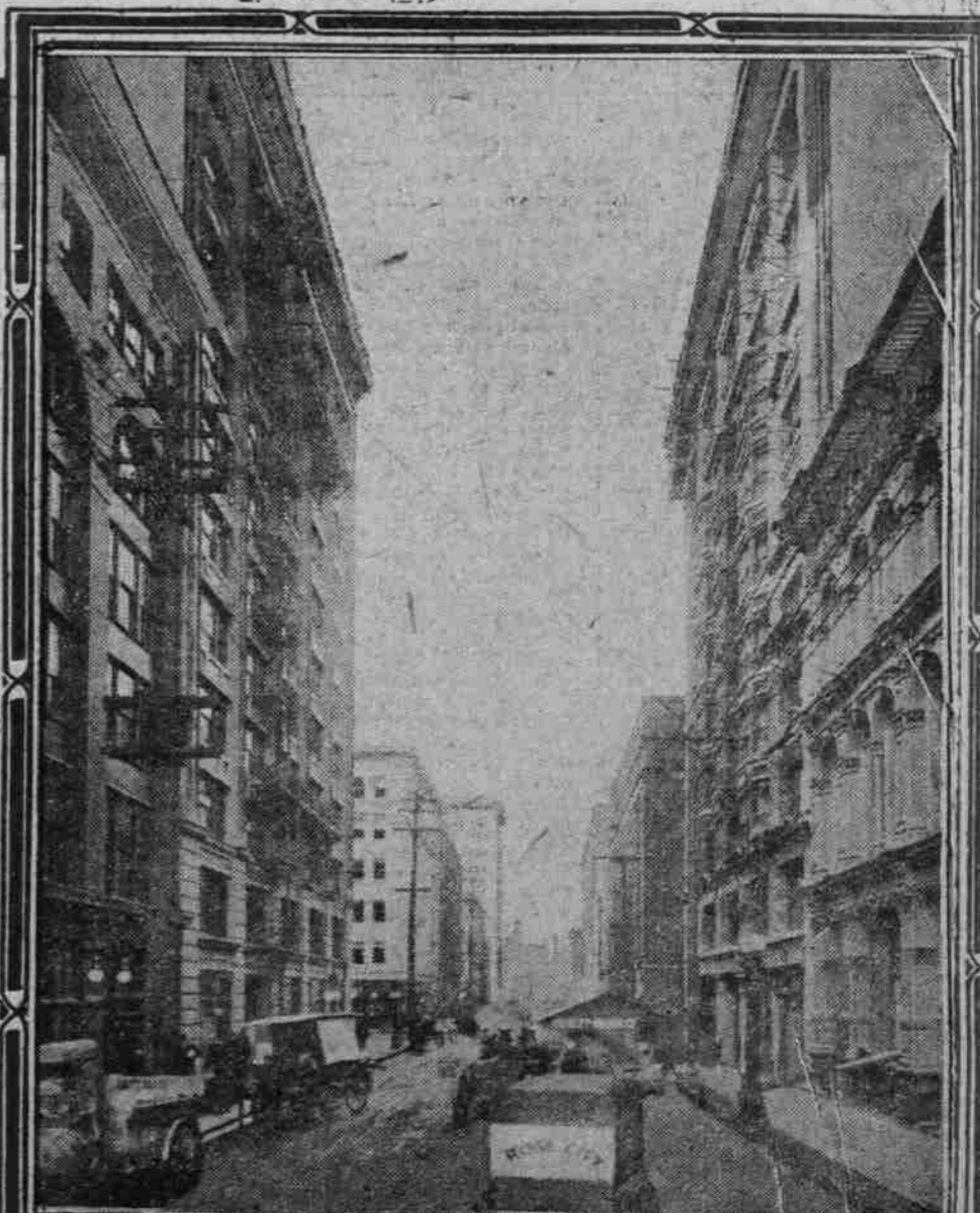
OAK STREET'S FINE OFFICE BLOCKS