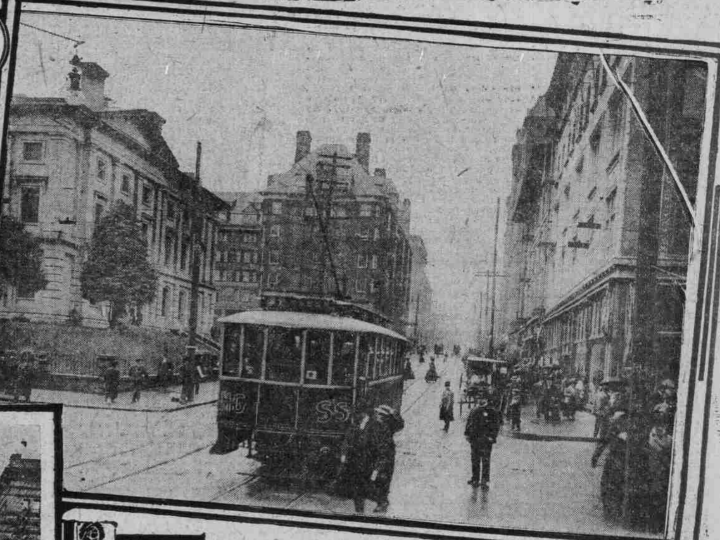
MORRISON STREET, WEST FROM FIFTH