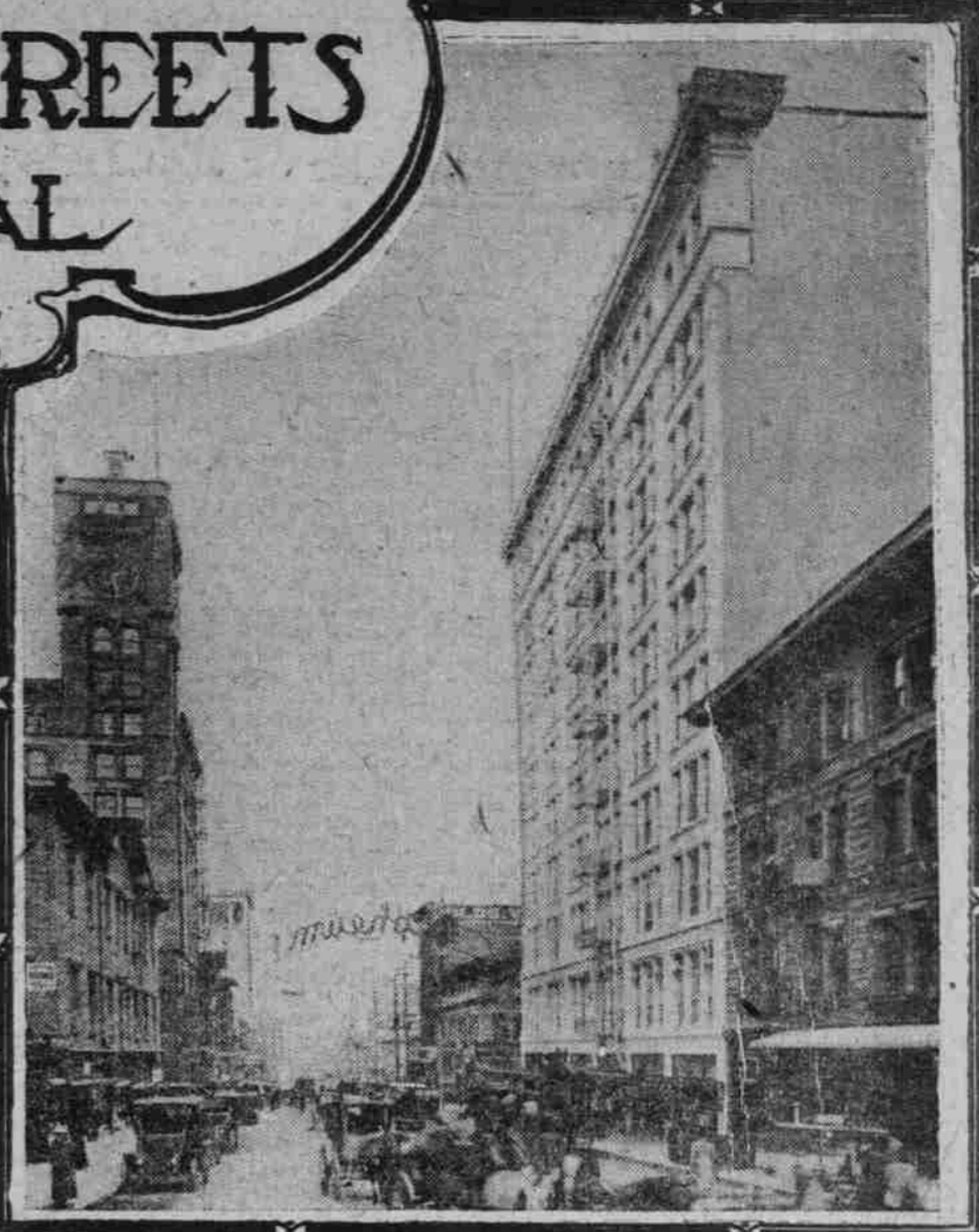
LOOKING NORTH ON MORRISON FROM PARK