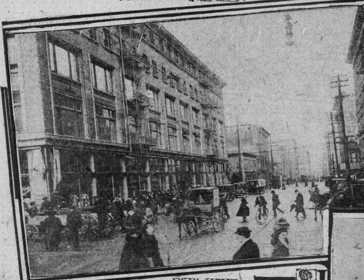
FIFTH STREET, LOOKING NORTH FROM MORRISON