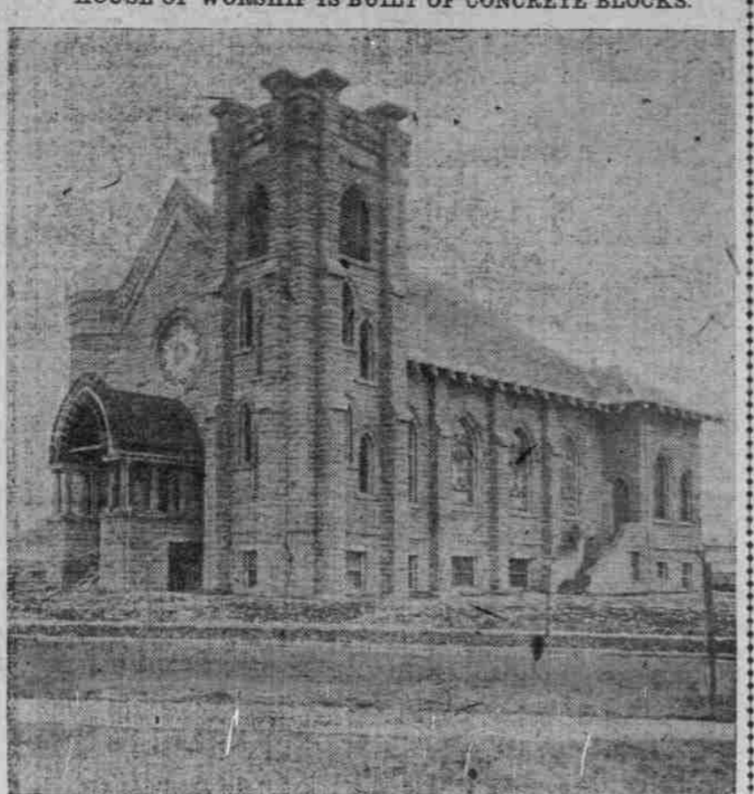
FIRST UNITED EVANGELICAL CHURCH ON EAST SIXTEENTH, NEAR HAWTHORNE.