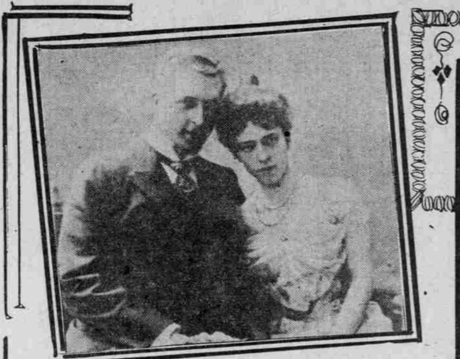
CROWN PRINCE ALBERT AND WIFE.

FAMILIAR SNAPSHOT OF KING OF THE BELGIANS, WHO IS DYING, PORTRAIT OF COUPLE WHO PROBABLY WILL BECOME KING AND QUEEN, AND VIEW OF ROYAL PALACE.