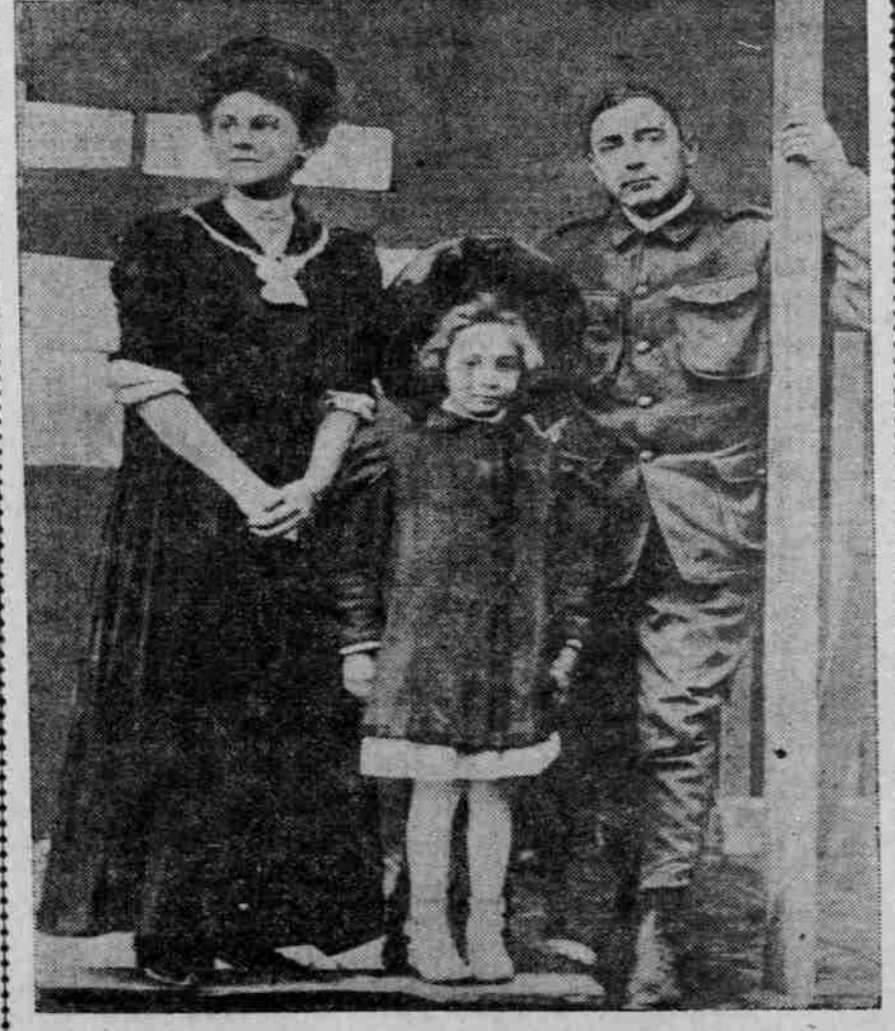
MR. AND MRS. HOWARD CHANDLER CHRISTY AND LITTLE GIRL, NATALIE.