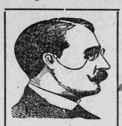
MY FEE IS WITHIN THE REACH OF THE WORKING MAN.

THE BEST EQUIPPED OFFICES IN THE WEST. If this is not true, I will fur-nish you my services FREE of charge.