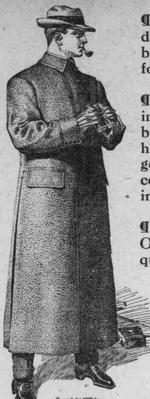
Copyright 1909 by Hart Schaffner & Marx