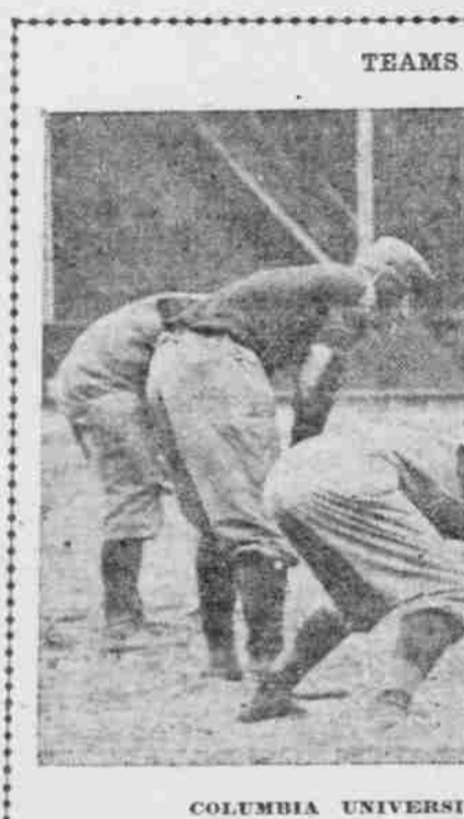
COLUMBIA UNIVERSITY HAS POSSESSION OF BALL—PORTLAND ACADEMY'S GOAL CAN BE SEEN IN BACKGROUND.