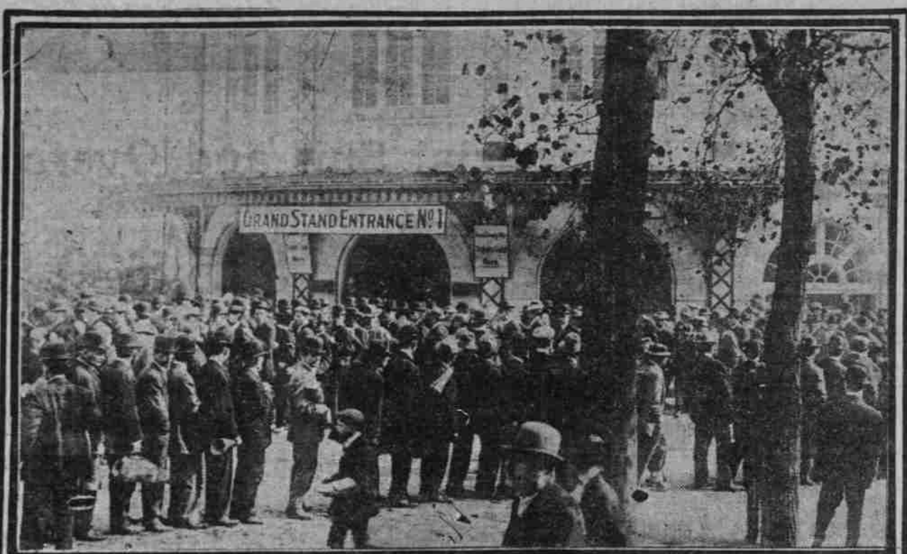
LINEUP FOR TICKETS - PITTSBURG - DETROIT GAMES