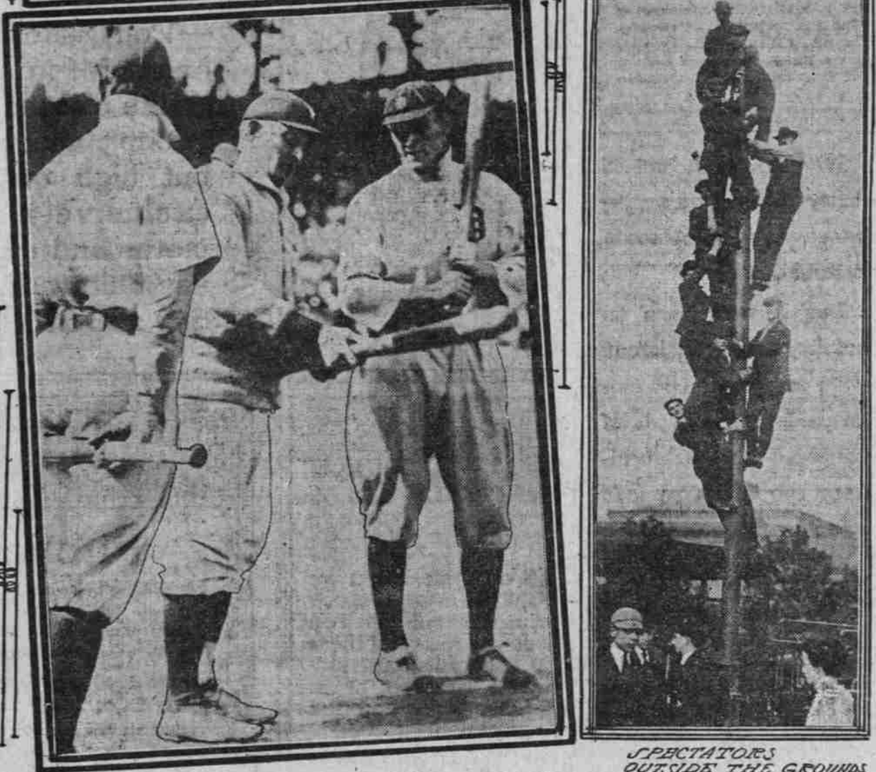
SPECTATORS OUTSIDE THE GROUNDS