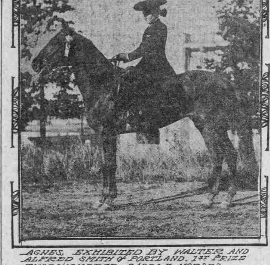
THOROUGHBRED SADDLE HORSES.

NORTH YAKIMA, Wash., Oct. 7.—(Special.)—Fifty-nine persons filed on White Bhiffs land in the North Yakima Land Office today. These are the persons who have been in line over two days, until