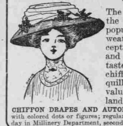
CHIFFON DRAPES and AUTOMOBILE VEILS, white grounds with colored dots or figures; regular $2.25 values, Wednesday in Millinery Department, second floor, at..... 98c