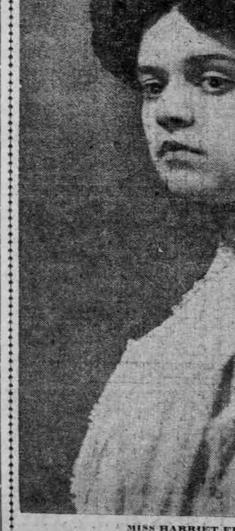
MISS HARRIET FRAHM, CONTRALTO.