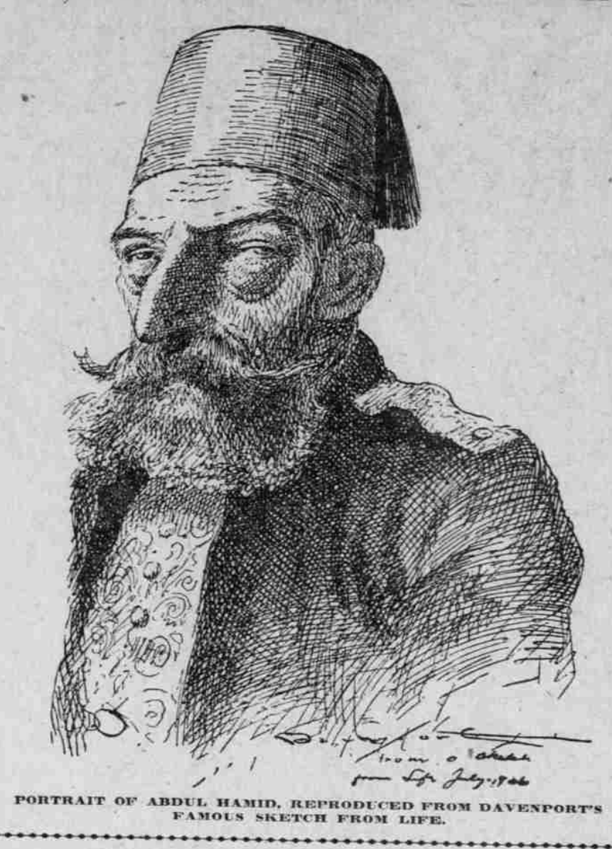
PORTRAIT OF ABDUL HAMID, REPRODUCED FROM DAVENPORT'S FAMOUS SKETCH FROM LIFE.