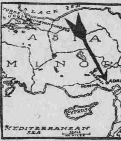
Arrow indicates Adana, where thousands have been slain.

In parliamentary circles the story is current that the Sultan declared that the culpability on his part in recent events could be proved, he would be prepared to suffer punishment. The lines of the Constitutional army are drawing closer and closer around the capital, and the advance guard is practically at the gates of the city.