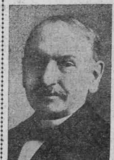
Theodore E. Burton, Way for Whose Election as Senator for Ohio is Now Clear.

"That the letters will make interesting reading goes without saying, for no one, on or off the stage, has been the recipient of more attention and admiration than the eternally youthful Lillian. By the publishing of these letters the actress will give the public a knowledge of her