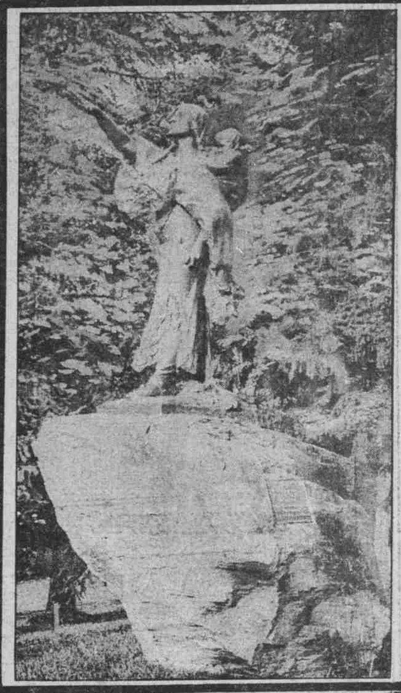
"SACAJAWEA" CITY PARK