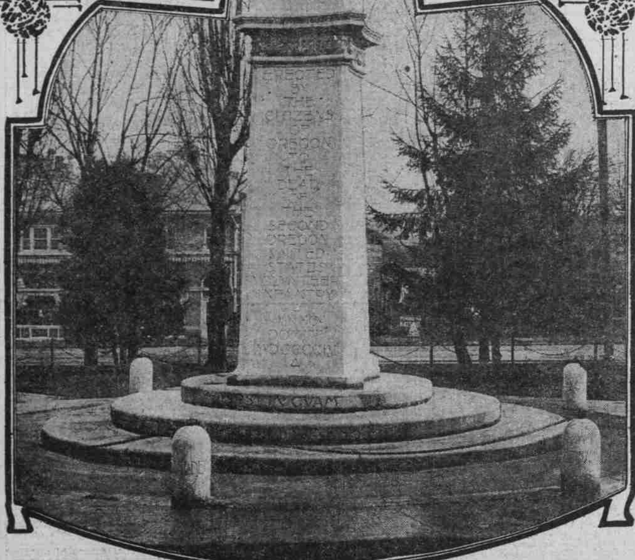
MONUMENT TO SECOND OREGON VOLUNTEERS, IN PLAZA BLOCKS