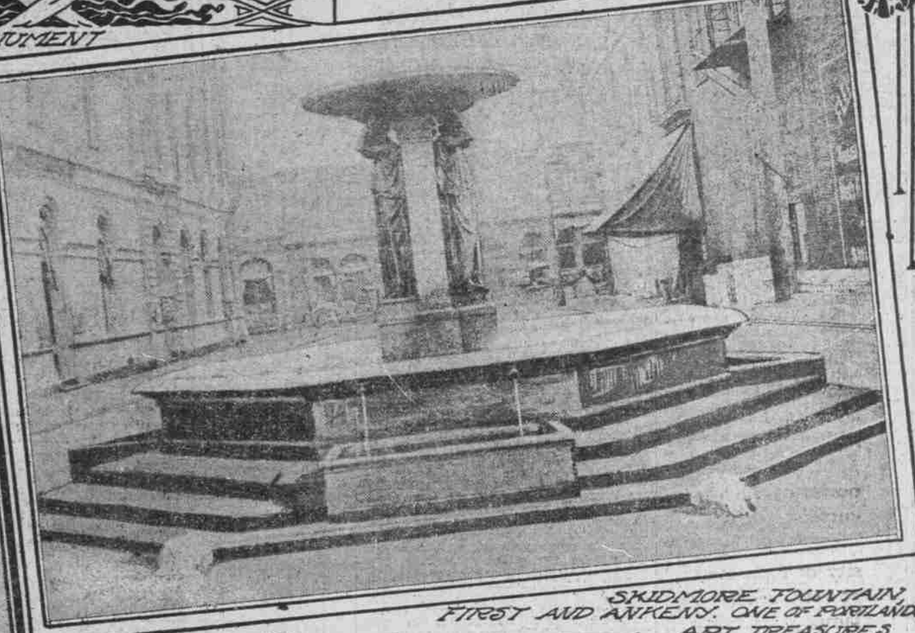
SKIDMORE FOUNTAIN, FIRST AND ANKENY, ONE OF PORTLAND'S ART TREASURES