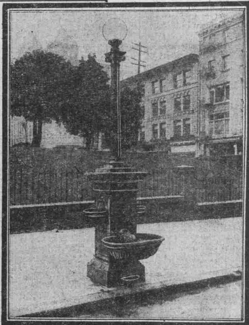
FOUNTAIN ON FIFTH ST. NEAR POST OFFICE