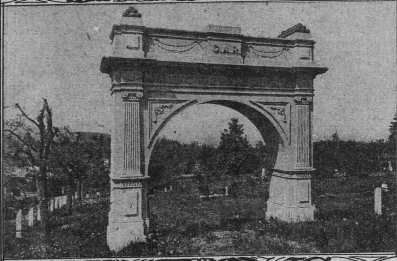
OLD SOLDIERS' MONUMENT AT G. A. R. CEMETERY