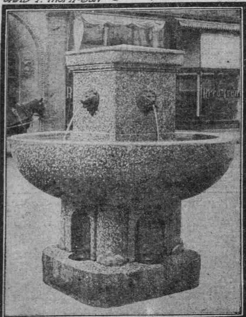
STREET FOUNTAIN AT 6TH AND ANKENY