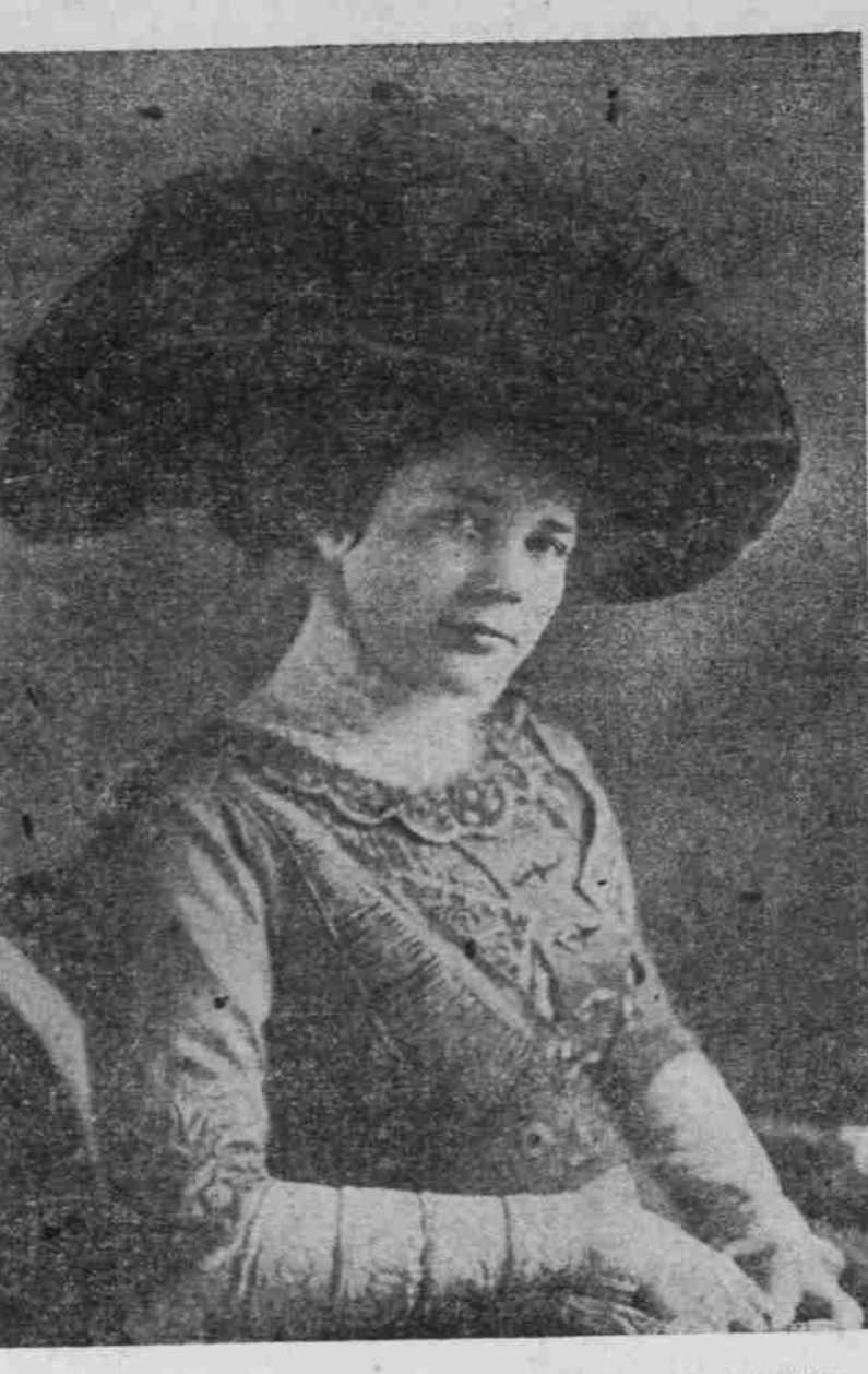
MISS ETHEL ROOSEVELT.