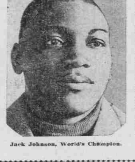
Jack Johnson, World's Champion.