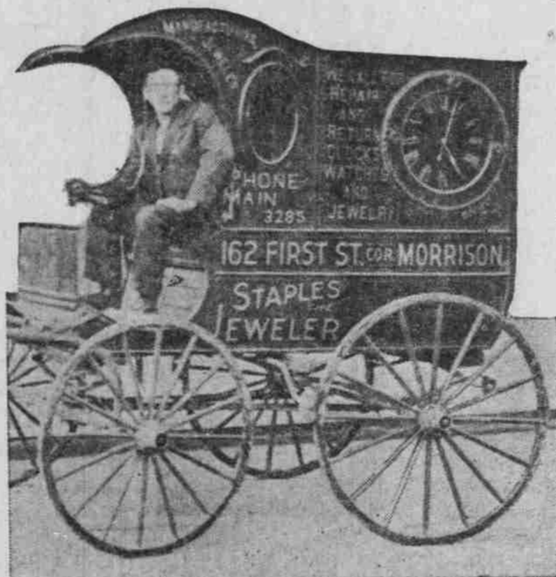
This Wagon Will Call for and Return to You Anything You Have for Repair in Our Line. PHONE MAIN 3285.