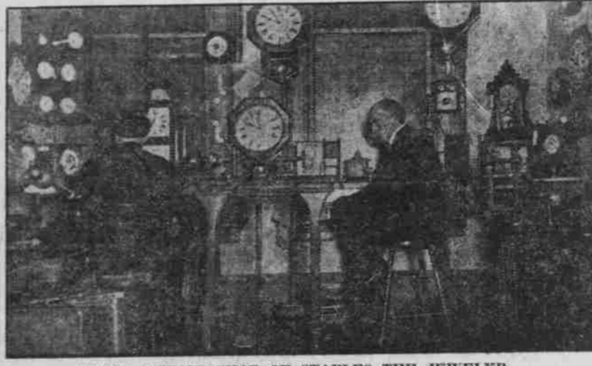
CLOCK REPAIR SHOP OF STAPLES THE JEWELER. Our clock repair shop is a curiosity in itself. We are prepared to repair, if necessary, 1000 clocks per month.