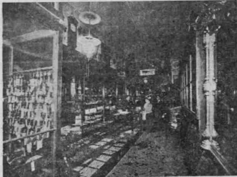
SALESROOM OF STAPLES THE JEWELER. No matter how crowded we may seem at any time, simply have patience and you will be waited on in a surprisingly short time.