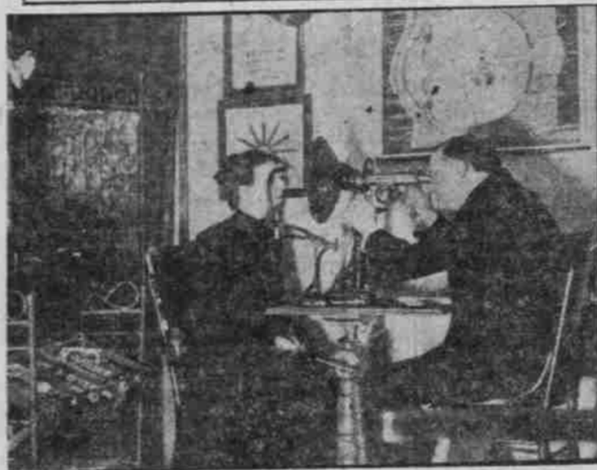
OPTICAL ROOM OF STAPLES THE JEWELER. Although small, it is completely equipped with all the latest mechanical contrivances for measuring eyesight.