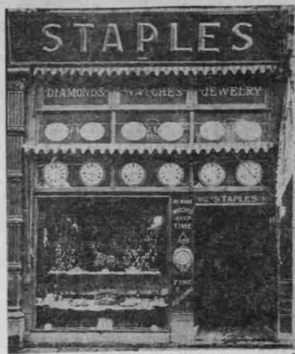
THE STORE TO LOOK FOR. Our store is hardly 15 feet by 45 feet, yet we do one of the most extensive retail jewelry businesses in the Northwest. Our stock is full and complete and is sold at prices which make our customers our lasting friends. We have and intend to hold the confidence and esteem of our customers. We would rather lose money than one of our customers, and our help know it.