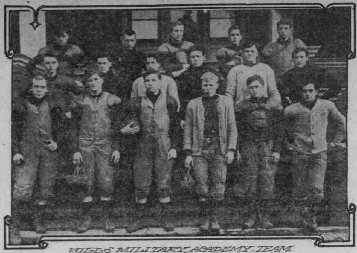
HILLS MILITARY ACADEMY TEAM