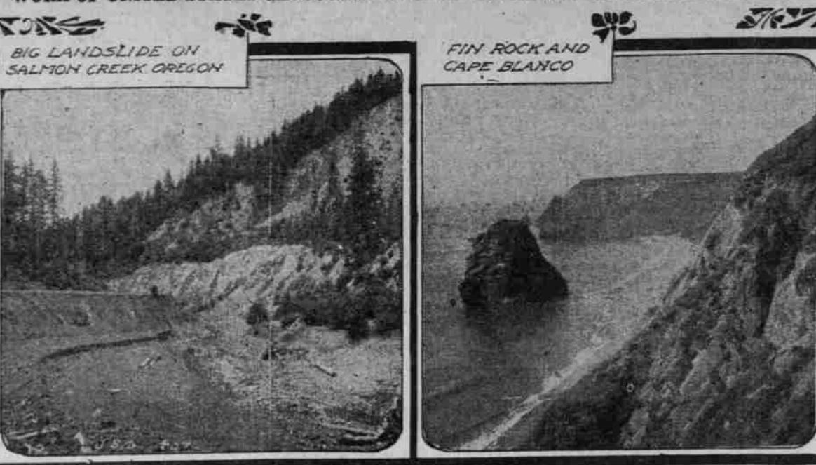
BIG LANDSLIDE ON SALMON CREEK OREGON