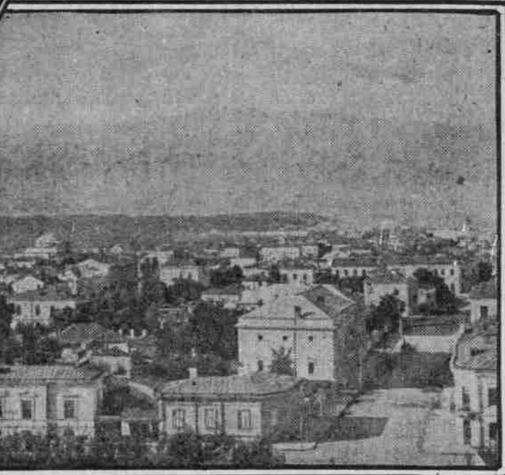
VIEW OF SOFIA, VITOSHA IN THE BACKGROUND