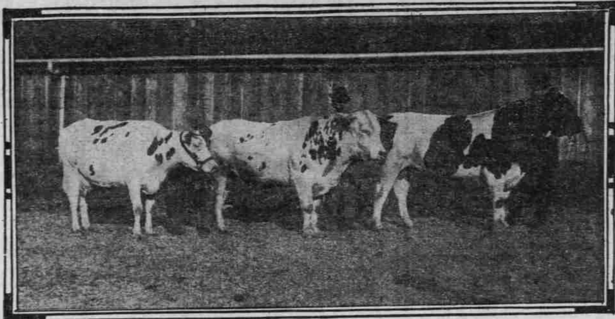
GROUP OF HOLSTEINS

Setting talk on "Grange Affairs," and commended these in vigorous language. Today is Oak Grove day. Prizes will be awarded at noon and the baby show will be held.