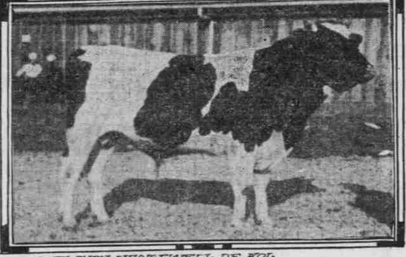
NONE SUCH HENGEWELL DE KOL 1st PRIZE SENIOR GAIK