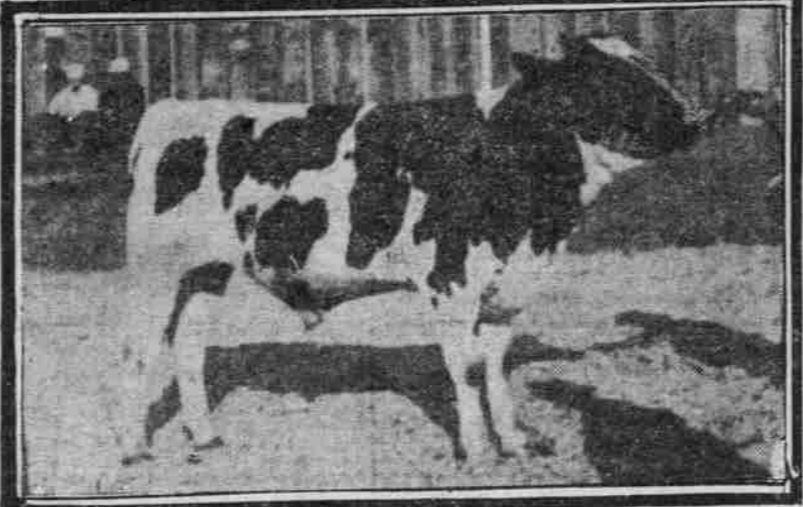
HAZELWOOD NATSEY GERBEN YEARLING HOLSTEIN, 1st PRIZE

$25,000 Stock New Fall Style Shoes Labeled Incorrectly.