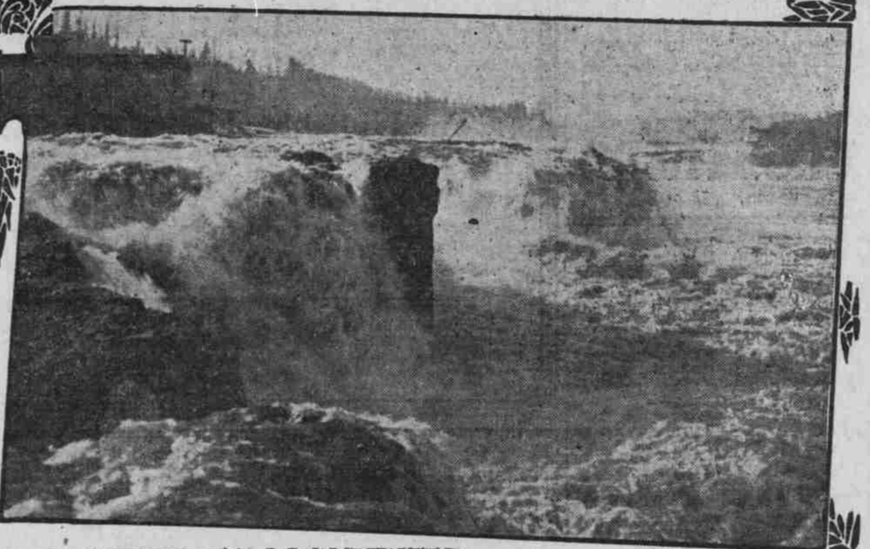
WILLAMETTE FALLS IN WINTER FROM A PHOTOGRAPH TAKEN TWO YEARS AGO