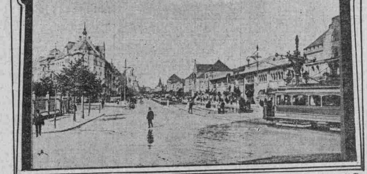
EXPOSITION BUILDING CHARLOTTENBURG