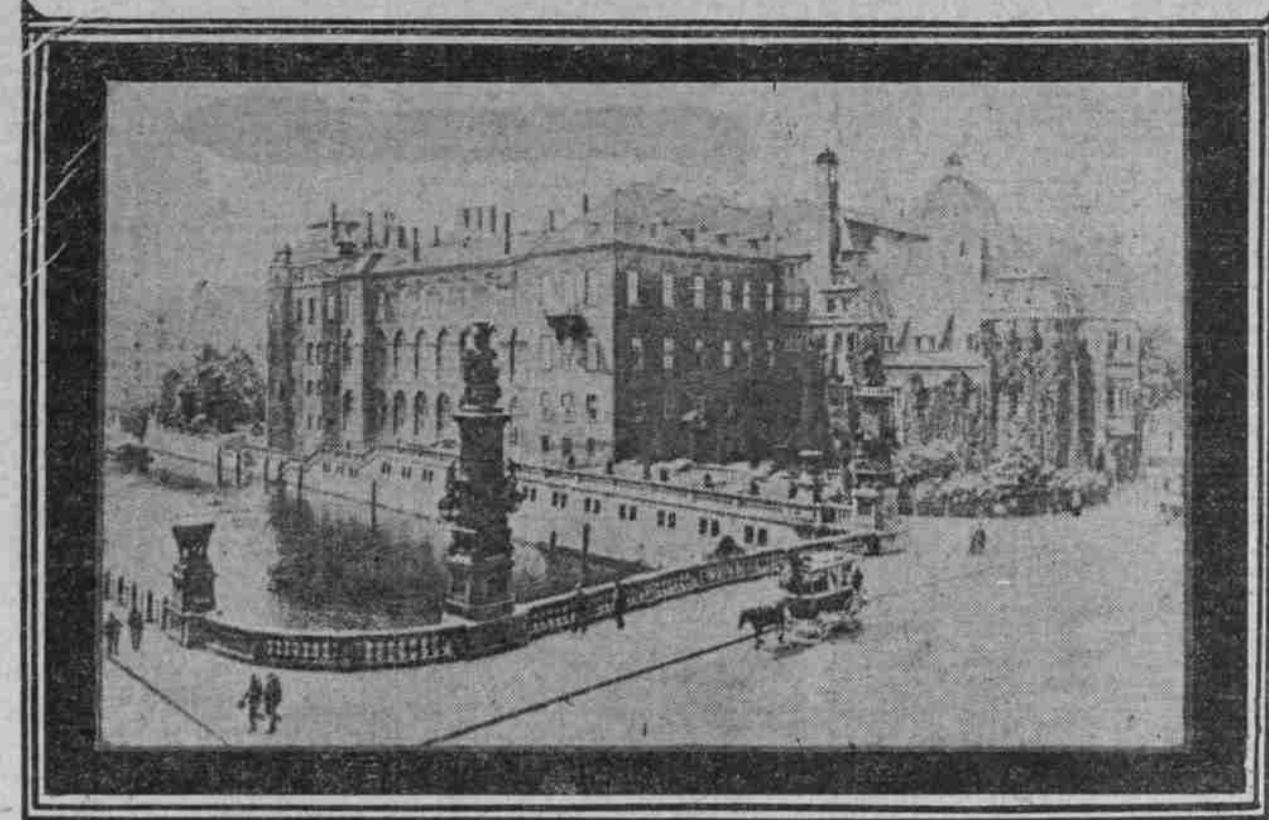
GLIMPSE OF THE ROYAL PALACE FROM THE EMPEROR WILLIAM BRIDGE

Former Portland Woman Describes Trip From Paris to Berlin—Belgium's Thick Population—Germany Impresses Traveler as Country Filled with Children and Geese.