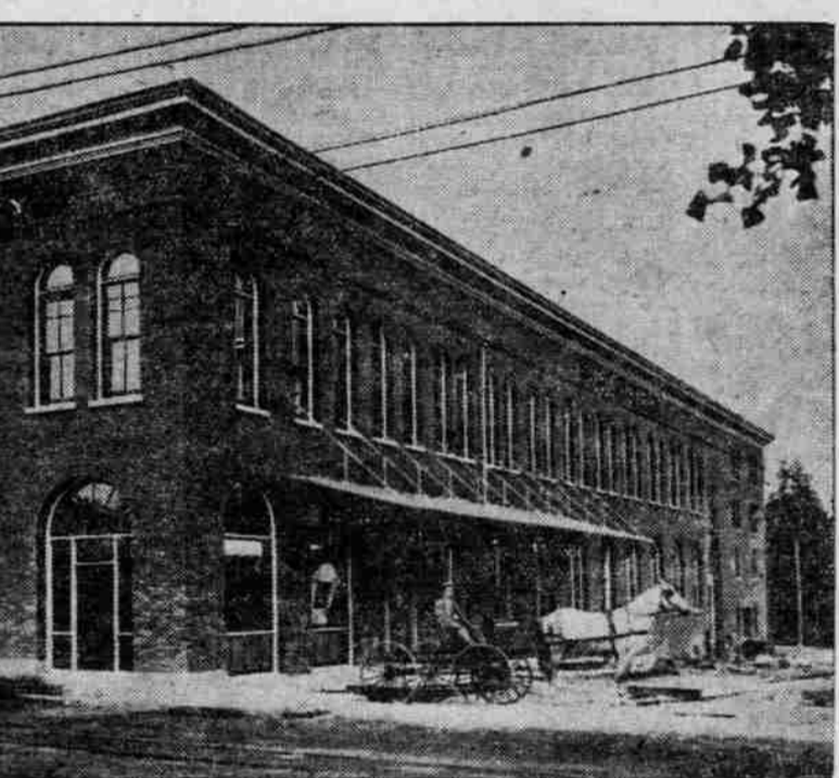
NEW BRICK BUILDING FOR THE YALE LAUNDRY COMPANY, EAST MORRISON AND TENTH STREETS.

As shown in The Sunday Oregonian yesterday, the four National banks of Portland have $1,500,000 of capital stock, about $2,000,000 of surplus, and total as-