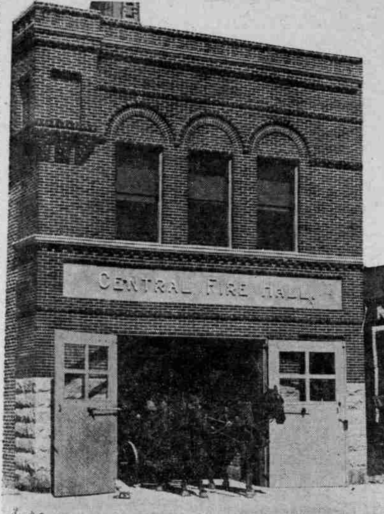
RECENTLY ERECTED AT A COST OF $10,000.

MEDFORD, Or., July 19.—(Special.)—Medford numbers among its municipal improvements for the present year a new City Fire Hall, built at a cost of $10,000. The building is complete in every detail, containing large, airy Council Chambers, a fireproof vault for the city's records and Recorder's office, and large sleeping rooms with bath room for the firemen. One of the rooms on the second floor will be used for the present as a library and reading room, the library having been recently acquired through the efforts of the women of the Greater Medford Club.