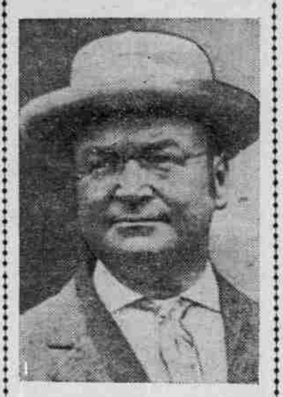
Nominee for Vice-Preside Whose Illness Has Taken Turn for the Worse,

This is part of the general plan of reorganization, intended to facilitate transac