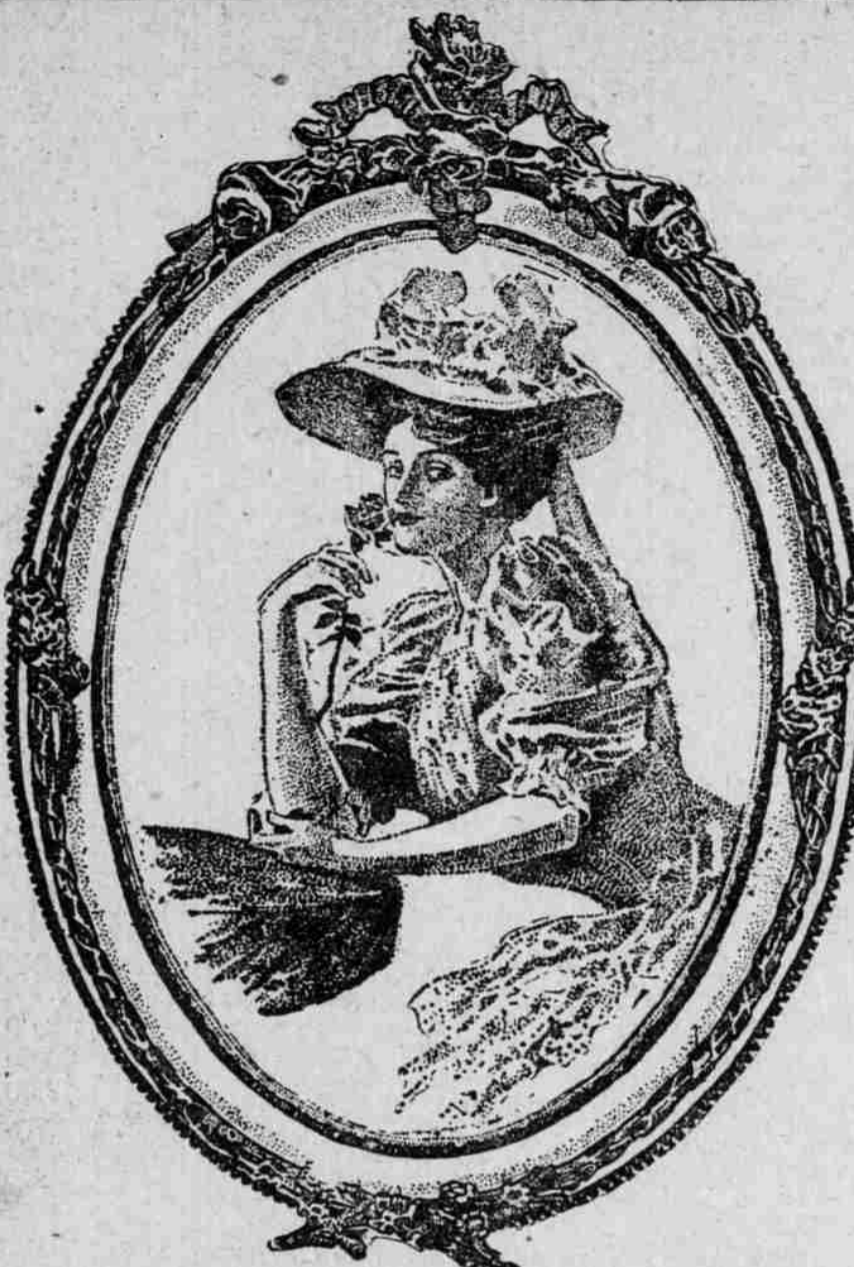
THE ROSE CARNIVAL GIRL

68 Highest-Class Tailor-made Suits go on sale Friday Bargain Day at a price so far below their real value as to be almost unbelievable. In plain and fancy trimmed styles of various materials, including White Serge Coat Suits in all the newest 36-inch lengths with circular and plaited skirts. Every garment new this season. Latest and best styles. Values to $45.00 For Friday's sale $18.65