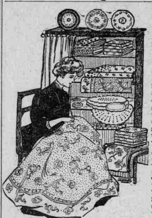
Table Damask 93c | Sale of 30 Napkins $1.87 Doz.

2500 yards fine bleached Satin Damask Table Linen, 72 inches wide, large assortment of new patterns; every yard in the lot our best $1.25 value. Buy all you want at tomorrow's 958th Friday Surprise Sale at this unusually low price, the yard. 93c Tomorrow, a great Friday Surprise Sale of 500 doz. bleached Satin Damask Table Napkins, very best patterns in great variety; regular $1.87 Our entire stock of fine Linen Sets on sale Friday only at one-fourth off the regular selling prices; an immense assortment of beautiful styles in all grades; economical housewives will take advantage of this 1/4 Off