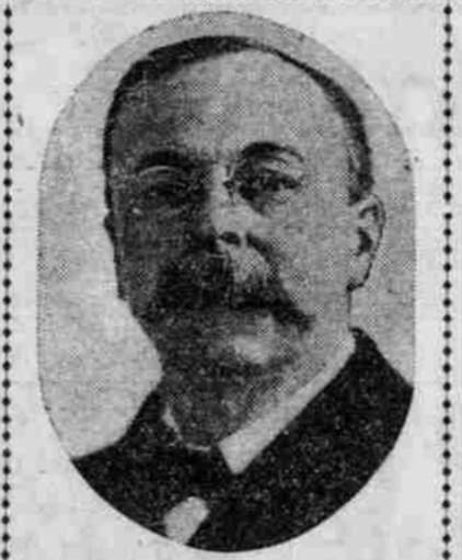
George E. Chamberlain, Democrat, Elected United States Senator.

CHICAGO, June 1.—(Special.)—The women transcontinental motor tourists who set out from Portland, Maine, on May 12, determined to make a 4000-mile run overland to Portland, Oregon, arrived in Chicago today.