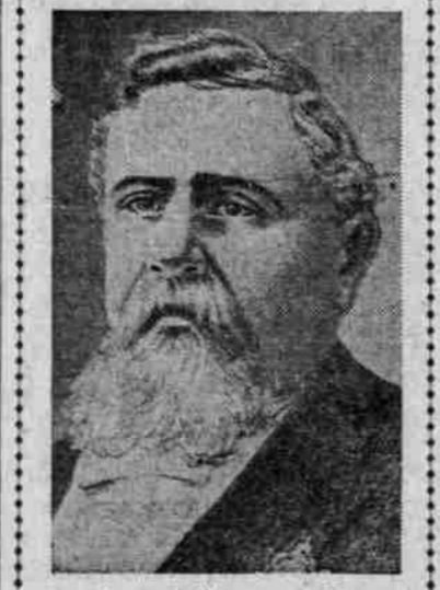
President Fallieres of France, who is visiting King Edward of Great Britain.

WASHINGTON, May 25.—With little discussion and less publicity the Senate has at this session passed on 27 treaties, more in number, if not in importance, than had been ratified during the 20 years preceding.