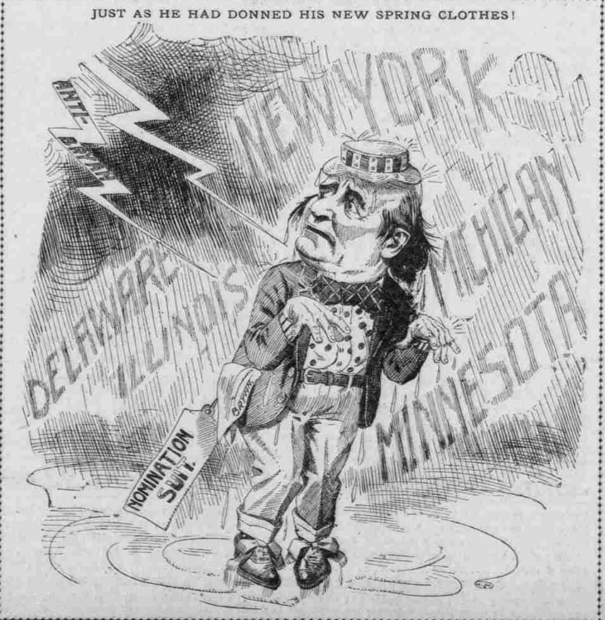
JUST AS HE HAD DONNED HIS NEW SPRING CLOTHES!

Chicago, April 17.—Headquarters for the promotion of the candidacy of Secretary of War Taft for the Presidential nomination were treated at the Great Northern Hotel here today.