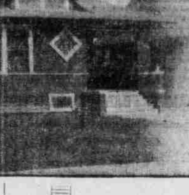
AN ATTRACTIVE BUNGALOW

Cost to Build, Exclusive of Heating Plumbing, $4000. By Glenn L. Saxton, Architect, 212-244 Security Bank Building, Minneapolis.