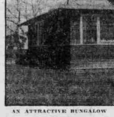
AN ATTRACTIVE BUNGALOW

Cost to Build, Exclusive of Heating Plumbing, $4000. By Glenn L. Saxton, Architect, 212-244 Security Bank Building, Minneapolis.