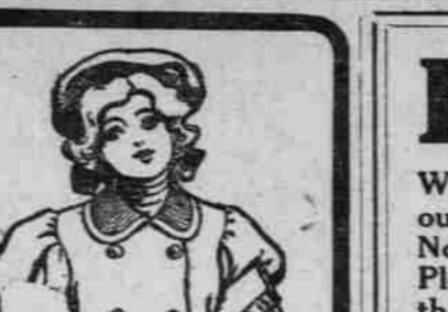
Dr. Williams' Pink Pills

Dr. Williams' Pink Pills are the tonic best suited to correct this condition, are safe, harmless and always helpful.