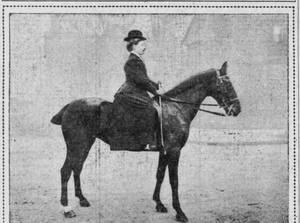
HAZEL, WHICH WILL BE ENTERED IN LADIES' SADDLE CLASS.