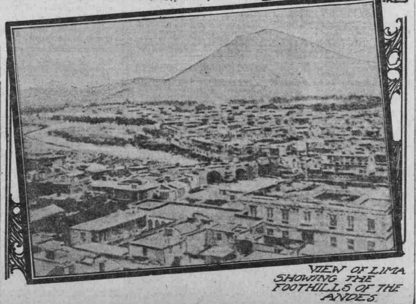
VIEW OF LIMA SHOWING THE FOOTHILLS OF THE ANDES