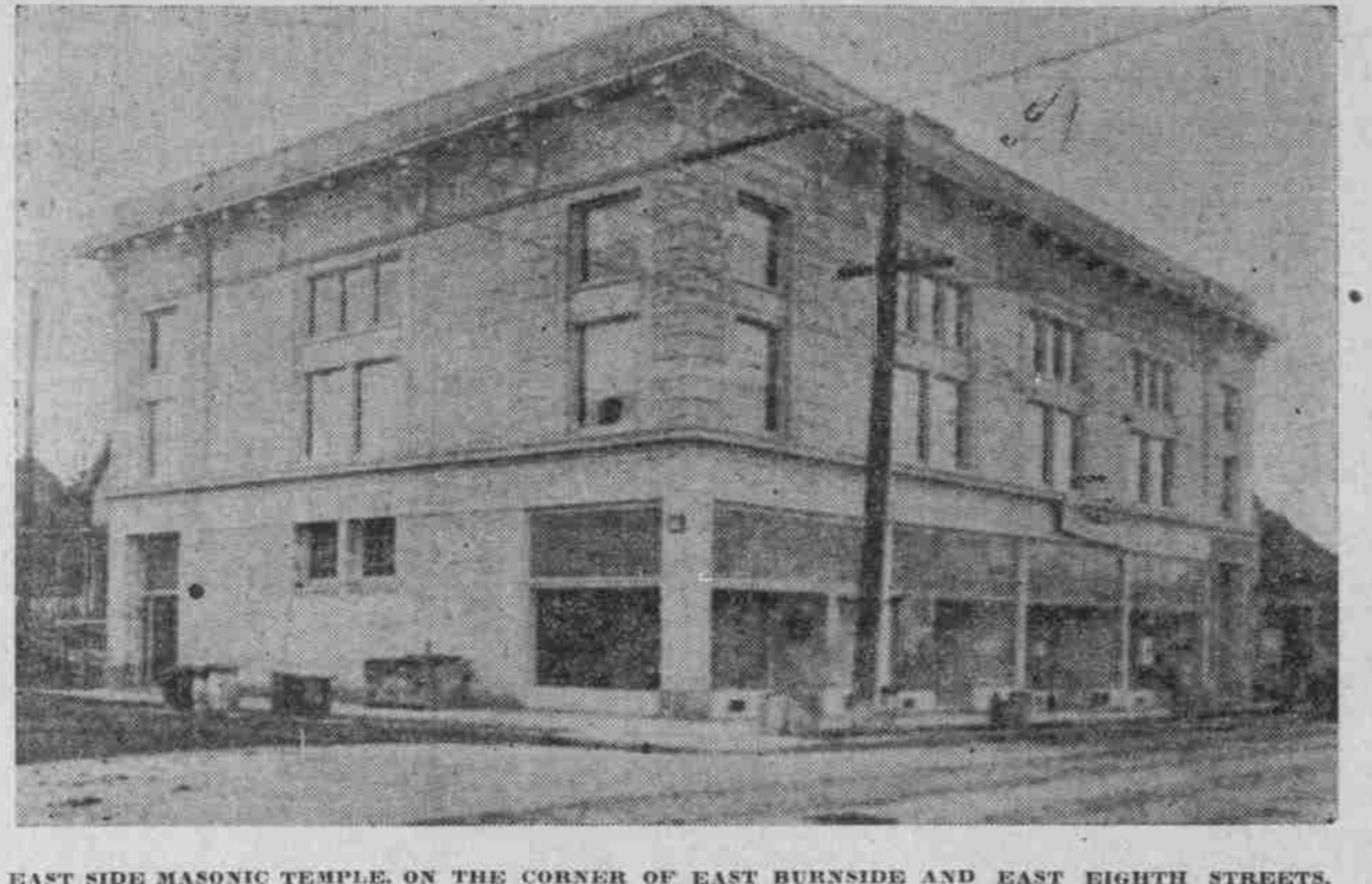
EAST SIDE MASONIC TEMPLE, ON THE CORNER OF EAST BURNSIDE AND EAST EIGHTH STREETS.

Peninsula ..... 111 Portland ..... 71 St. John ..... 76 Total Albina district ..... 258 Total East Side ..... 2045 Total Albina district ..... 2045 Total East Side ..... 4164 School census January, 1908— District No. 1, which comprises several suburbs adjacent to the city limits, to-wit: Arleta, Lenta, Mount Taber, Mount Taber Hill and other districts. Total school attendance ..... 32,294 East Side, south of Sullivan's Gulch ..... 12,613 West Side, north of Sullivan's Gulch ..... 19,681