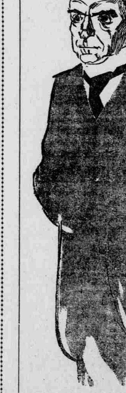
Under the caption, "Bourne, of Oregon, Just Talks Roosevelt: He is the Senator Who Disclosed the Dark Conspiracy Against the President," the New York World prints the above cartoon and the following skit from its Washington correspondent.

NEW YORK WORLD PRINTS A CARTOON OF SENATOR BOURNE