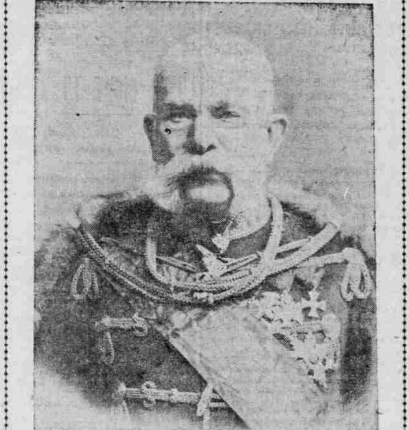
EMPEROR FRANCIS JOSEPH OF AUSTRIA, WHO IS NOW SUFFERING FROM WHAT MAY PROVE TO BE HIS LAST ILLNESS.