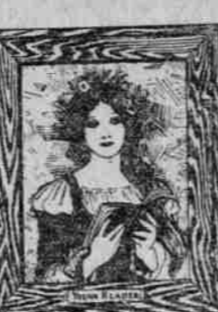
11 1/2 x 14 1/2, solid oak Frames, many subjects; regular price 69c; fourth floor special 47c

Our selection of Framed Pictures, Mat Pictures, Passeportants, etc., were never more complete than now. You will always find our Gift Room interesting when you have a moment to spare.