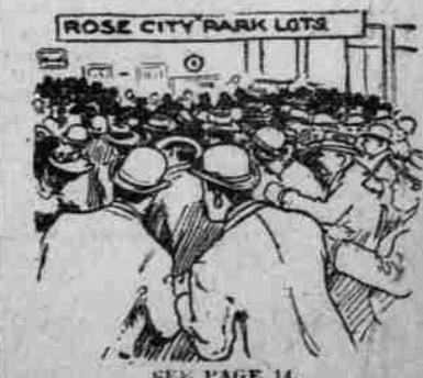
SEE PAGE 14.

right-of-way with its own donkey engines and the contract for the bridges has been let to a Portland company. The contract provides that the grading and bridges must be completed before June 1, and the intention is to have the road finished so that the hauling of logs can be commenced not later than July 1. Senator Fulton to Speak at Fair. WOODBURN, Or., March 20.—(Special.)—Senator Fulton, has accepted an invitation to speak at Woodburn next Saturday, when the Livestock Fair will be held here. There are many blooded horses entered and the exhibit will be one of the best of its kind that has been held in this section. An immense gathering of farmers and those interested in good breeding is expected.