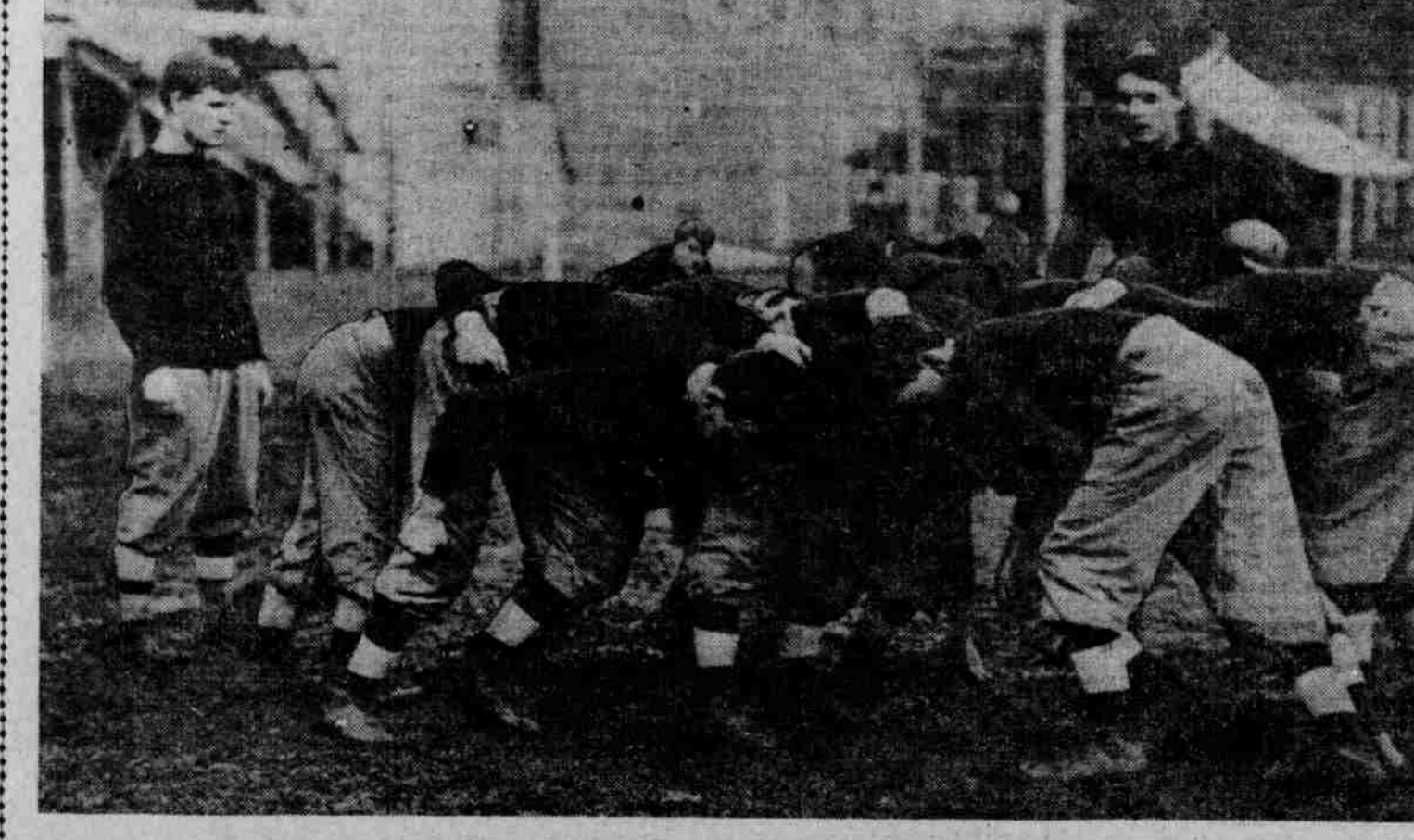
TEAM LINED UP FOR SCRUM ON MULTNOMAH FIELD.

second, Lady Wrennman third; time, 1:41 1-5. One mile and 50 yards—Colonel Houston won, Prince Ching second, Lillie B. third; time, 1:48. Five furlongs, setting—Doolittle won, John of Arc second, Buns third; time, 1:03 1-5.