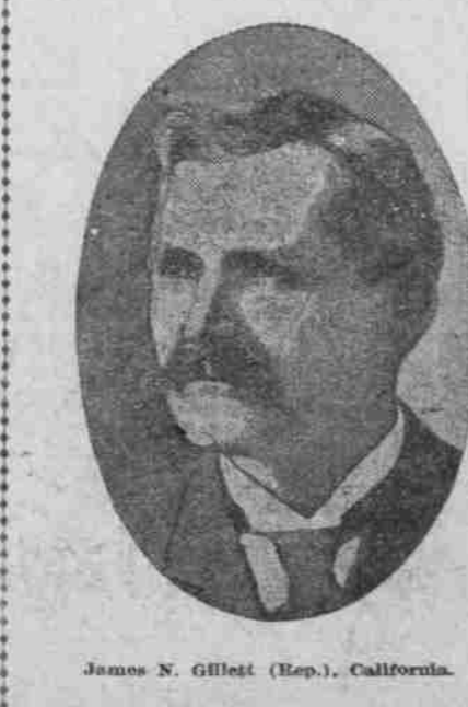
James N. Gillett (Rep.), California.