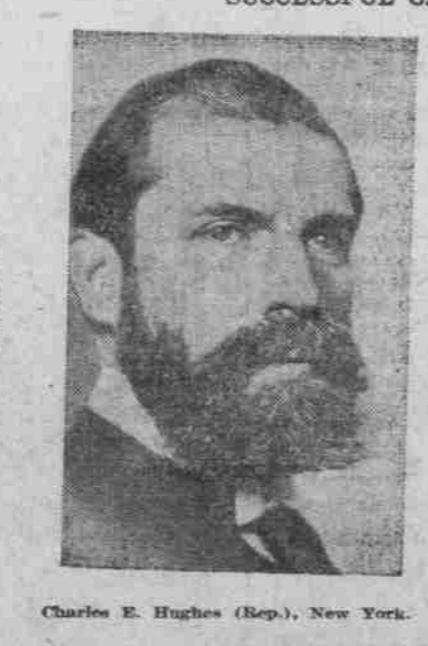
Charles E. Hughes (Rep.), New York.