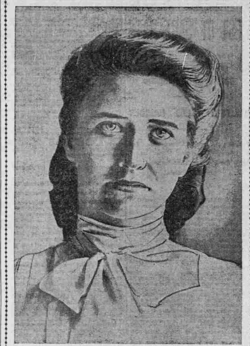
GIRL WHO KILLED HER BROTHER HAS NO AVERSION TO BEING PHO-TOGRAPHED.

BO.66. CLASS & BUILDINGS IR BUSINESSECTION